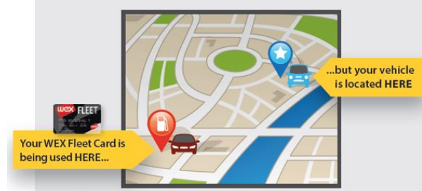
Your Fuel Guard report reflects all discrepancies